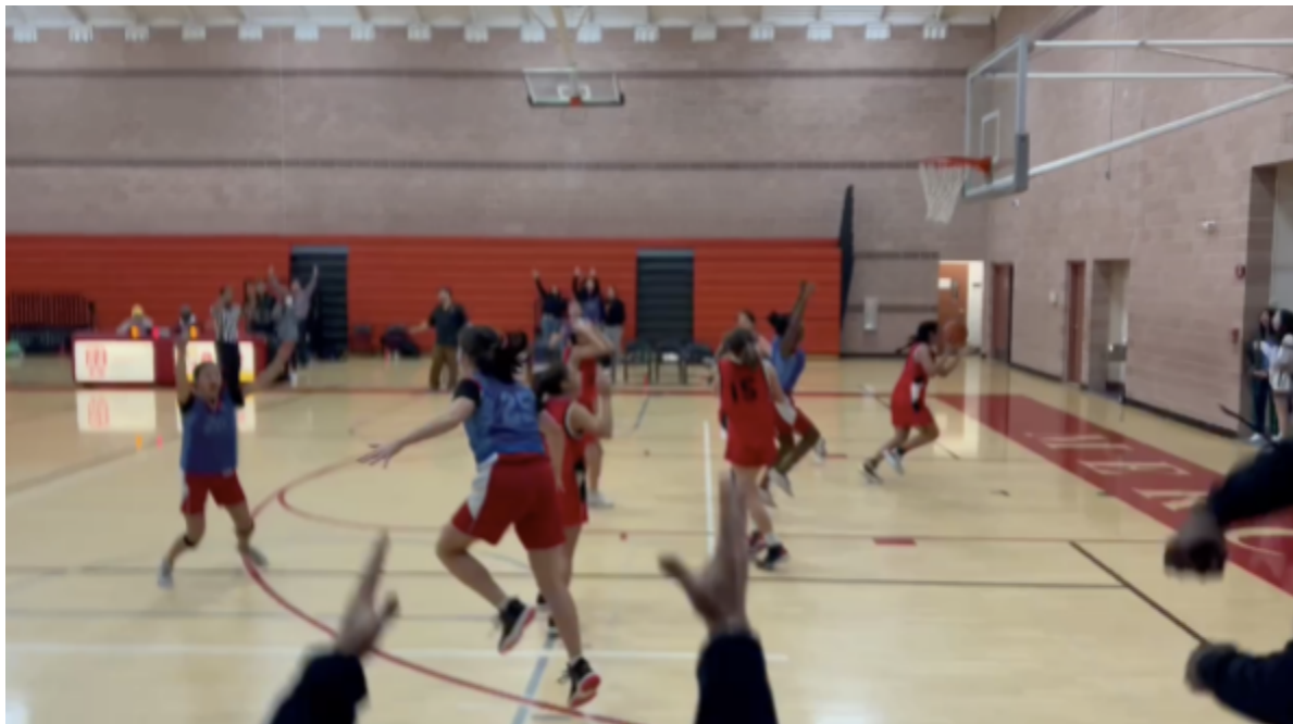
Girls Varsity Basketball exulting at the buzzer-beating shot that won them the league championship title this year!

Email cover letter, resume, and list of references to middle_school_jobs@cais.org . In the subject line please indicate "PE Teacher and Interim Athletic Director." In your cover letter please reference how you learned of this opening. Please no calls.